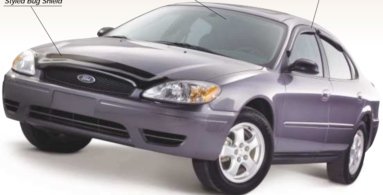
Styled Bug Shield