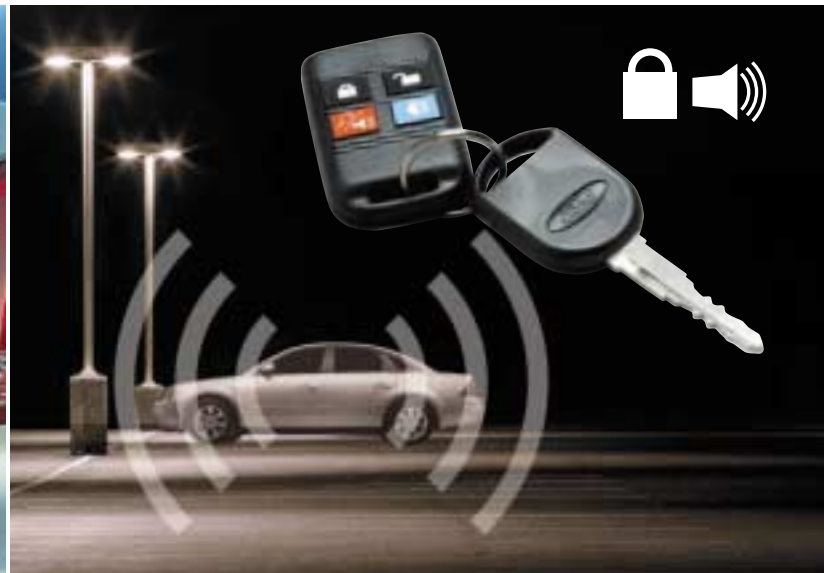
Vehicle Security System. On page 7, we offer products that are designed for your convenience and protection. This popular, state-of-the-art system protects your vehicle and its contents.