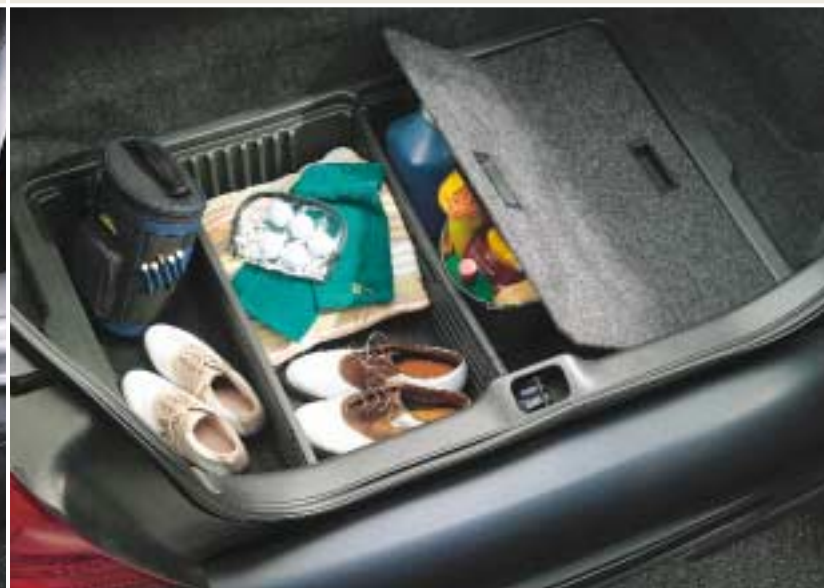
Cargo Organizers. One of our top-selling accessories, this organizer helps keep your personal items organized and readily accessible (available for Crown Victoria only). For more details and additional organizing options for both vehicles, see page 6.