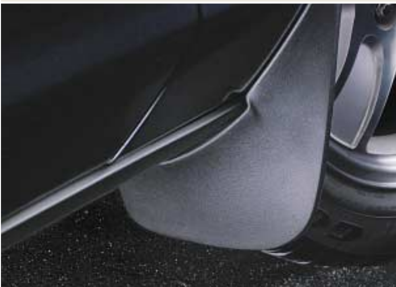
Molded Splash Guards. Our best-selling splash guards protect against mud, snow and ice. You'll find these and other splash guards on page 4.