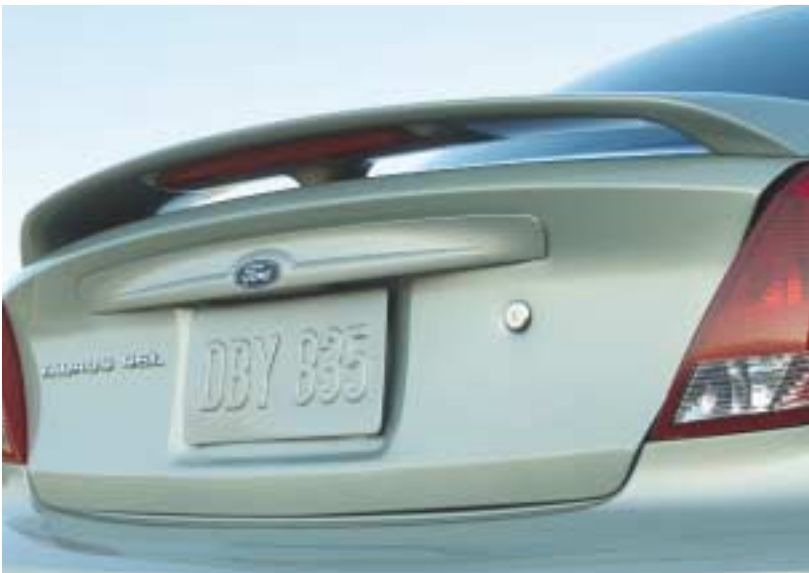
Rear Spoilers. Add sporty style to your Taurus or Crown Victoria with our top-selling spoilers. See both options, plus other exterior enhancements on pages 4-5.

Turn the page and discover a complete catalog of great choices to help you personalize your new Taurus or Crown Victoria. Engineered by Ford for a perfect fit and long-wearing durability, Genuine Ford Accessories embody the classic style and performance that complement your good taste and make every drive complete. They're the perfect travel companions cross-town or cross-country. What's more, you can rely on precise professional installation at your Ford dealer and the backing of one of the industry's strongest limited warranties.