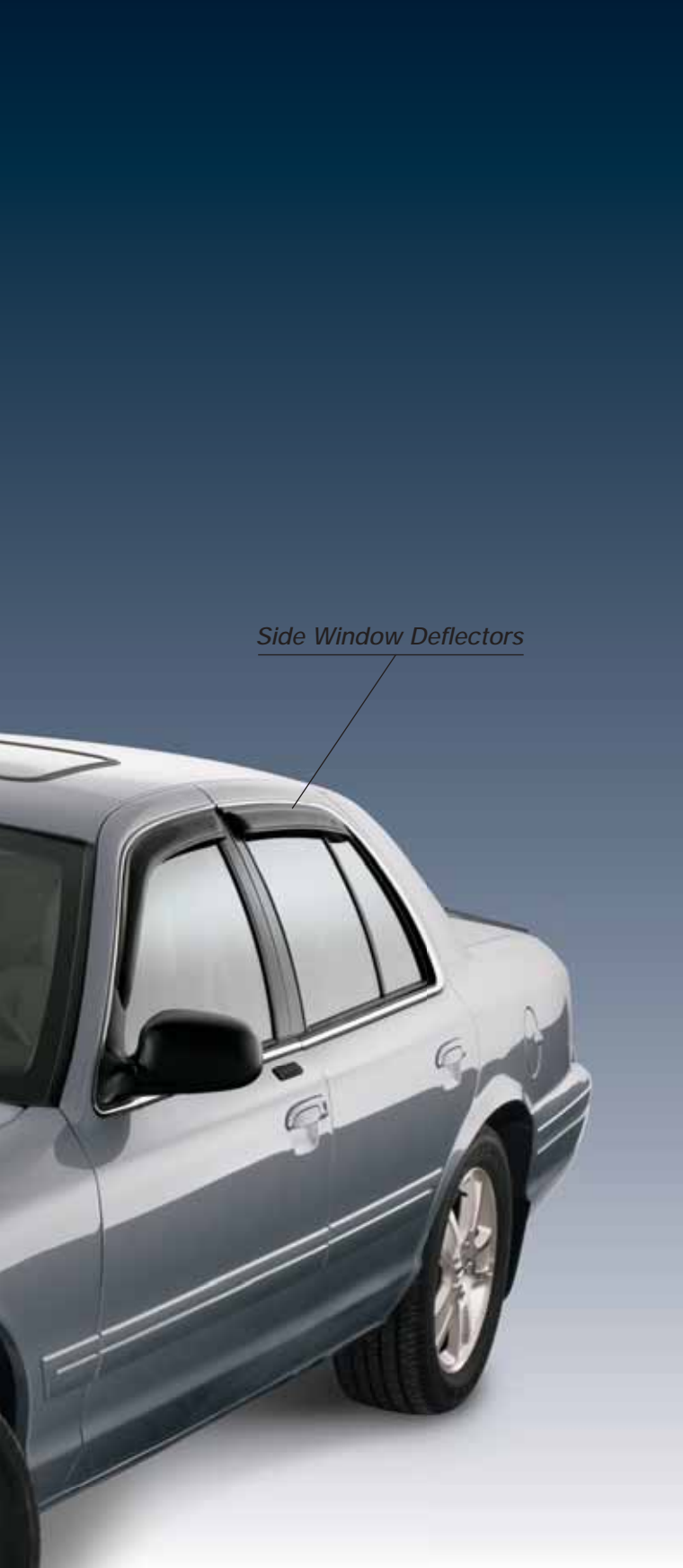
Side Window Deflectors