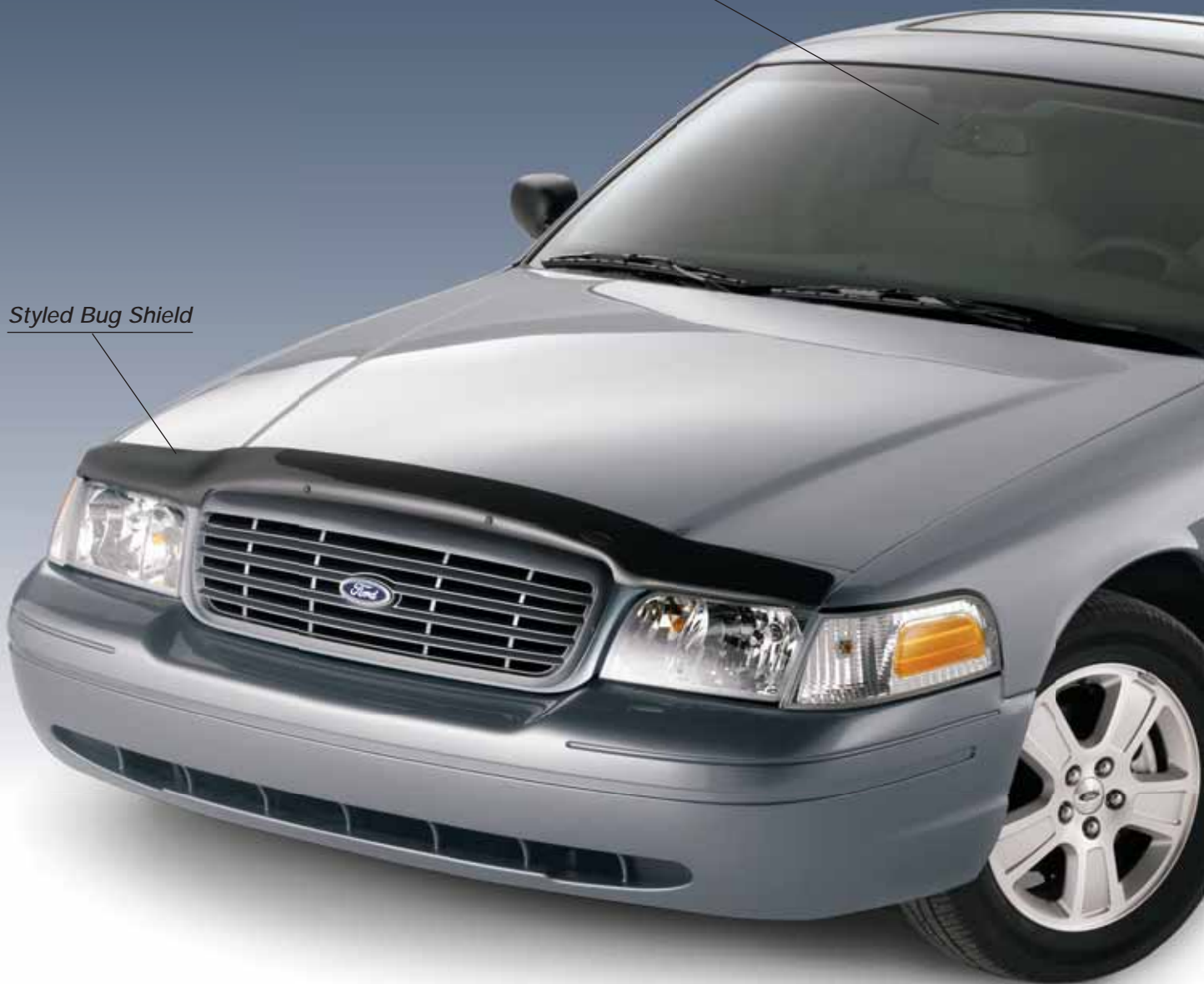
Styled Bug Shield