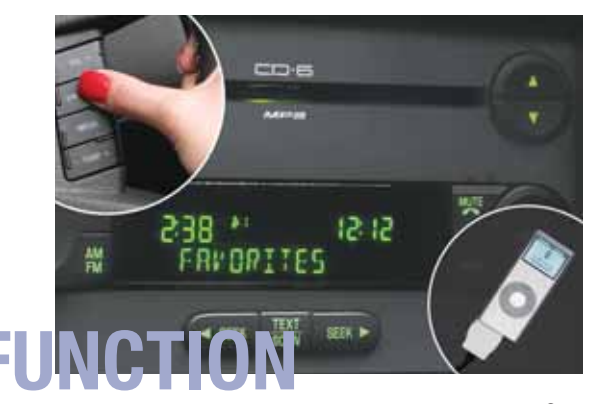
TripTunes <sup>TM</sup> Advanced. Now you can listen to your iPod<sup>®</sup> through your vehicle's speakers. Check out the coolest way to hear your favorite tunes on page 8.

Bug Shields. Our top-selling bug shields provide protection for the edge of your hood and a stylish design. These and other exterior enhancements can be found on pages 4-7.