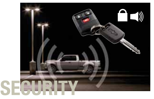
Vehicle Security System. On pages 8-9, we offer products that are designed for your convenience and protection. This state-of-the-art system protects your vehicle and its contents.