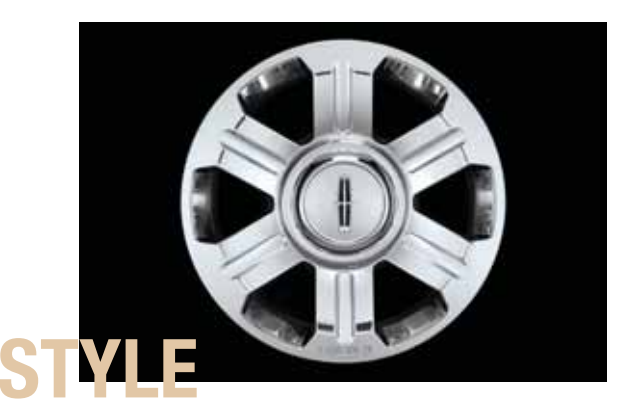
Custom Wheels. This Mark LT wheel rocks...and keeps you rolling in style. See page 11 for more information.