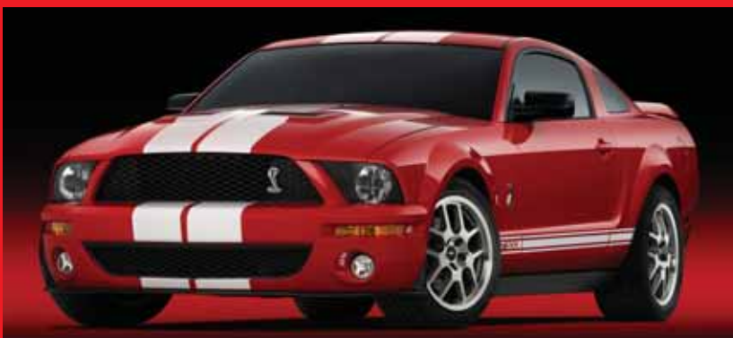
Mustang Shelby GT500

For a detailed description of the parts that comprise each pack, as well as other Ford Racing Performance Parts and additional warranty information, visit us at www.fordracingparts.com or call 800-FORD-788. Please check our website for updates.